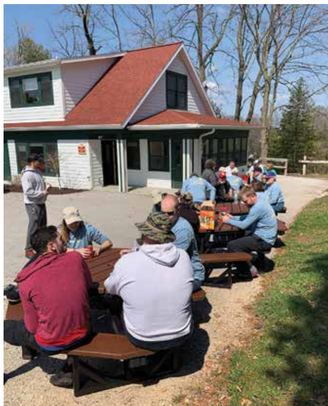
Thanks to the Friends of Camp Brosilius for gifts last summer to help camp buy these picnic tables.