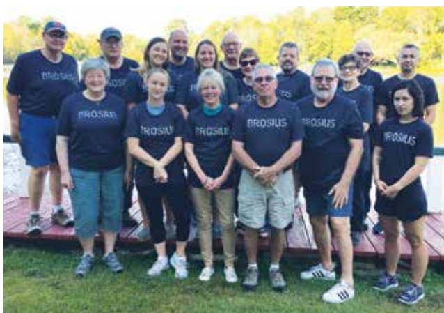
Thank you, 2018 fall volunteers.

Thank you for honoring these individuals in such a special way.