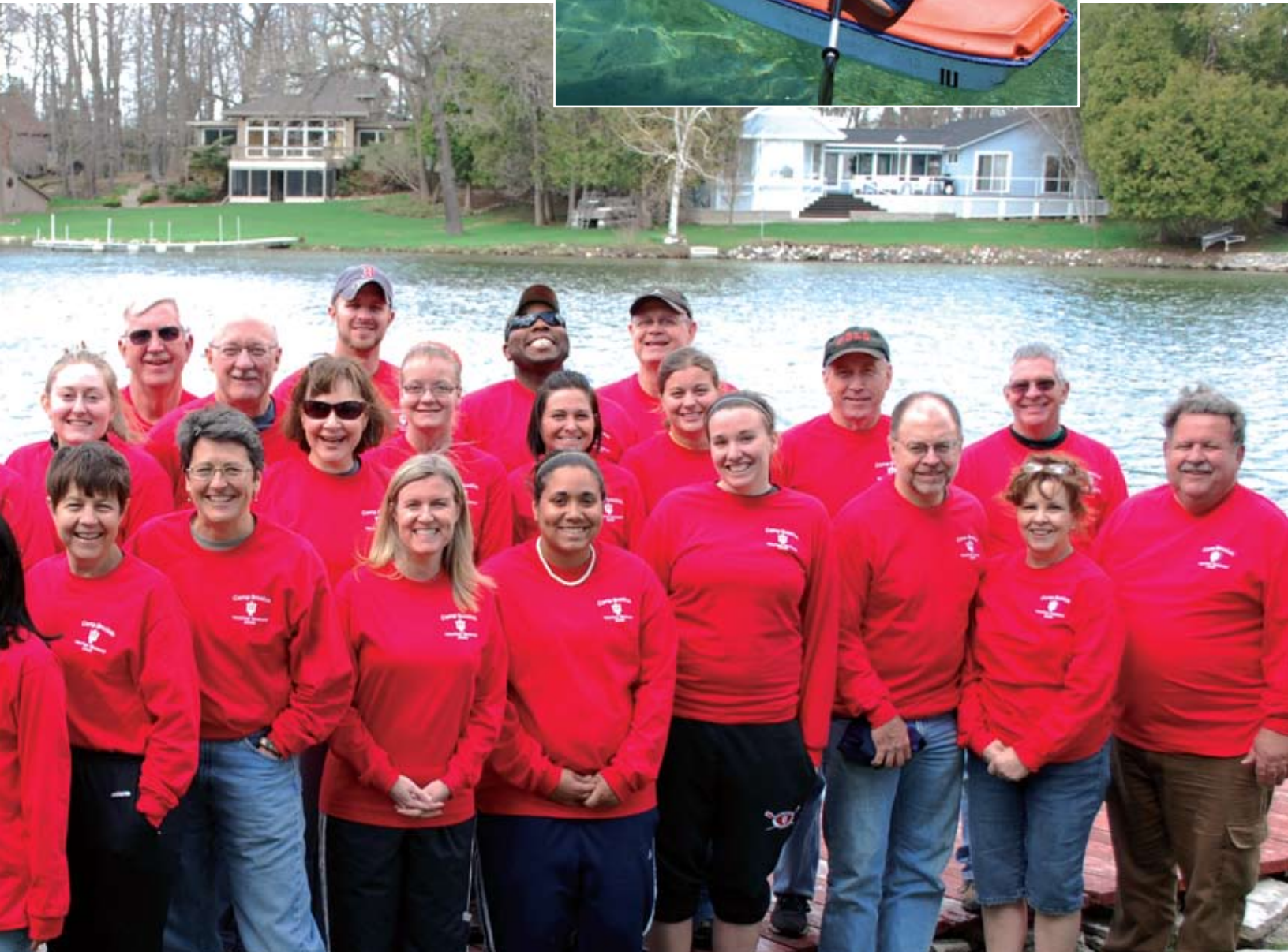
Annually, volunteers help open and close camp, as well as replace screens, assemble and move furniture, and renovate small spaces.