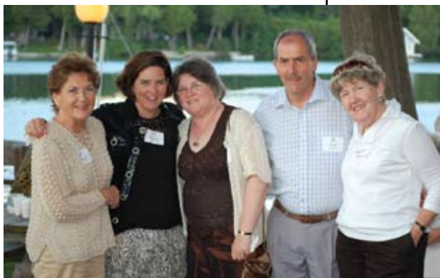
Camp Brosius neighbors and friends from Elkhart Lake stage annual dinner fundraisers to help with camp renovations. Many also contribute annually beyond the dinner proceeds.